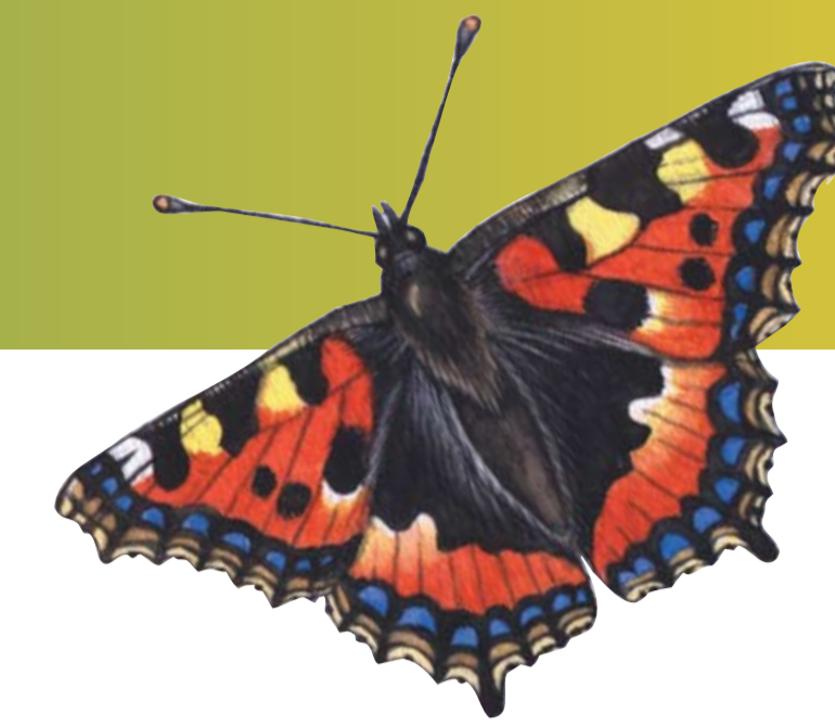
Small tortoiseshell butterfly