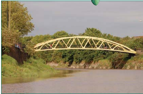
Banana (Langton Street) Bridge today