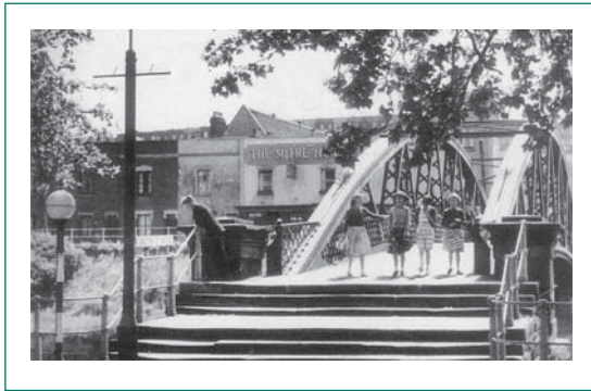
The Banana Bridge in the 1950s